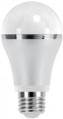
Light Emitting Diode (LED) Light Bulb