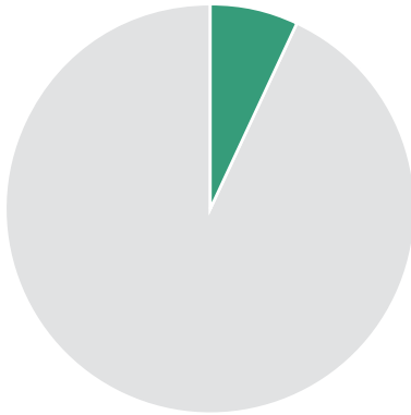
ZECs as % of Total Retail Sales for the 12 months ending June 30, 2019